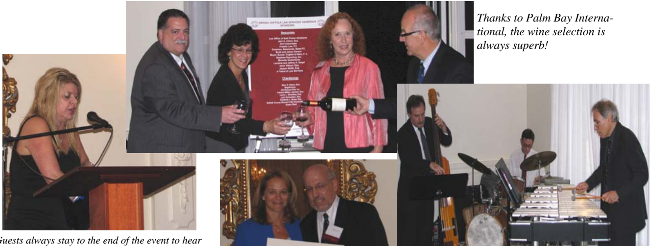
Thanks to Palm Bay International, the wine selection is always superb!