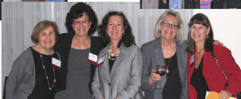
Law Services' Staff and volunteers helped to make the evening a success