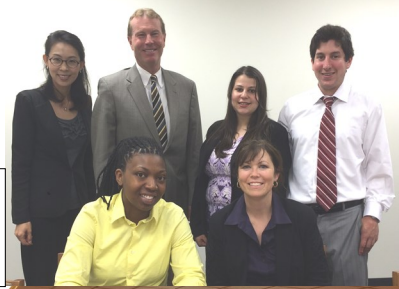
left Students visit the Suffolk County Bar Association